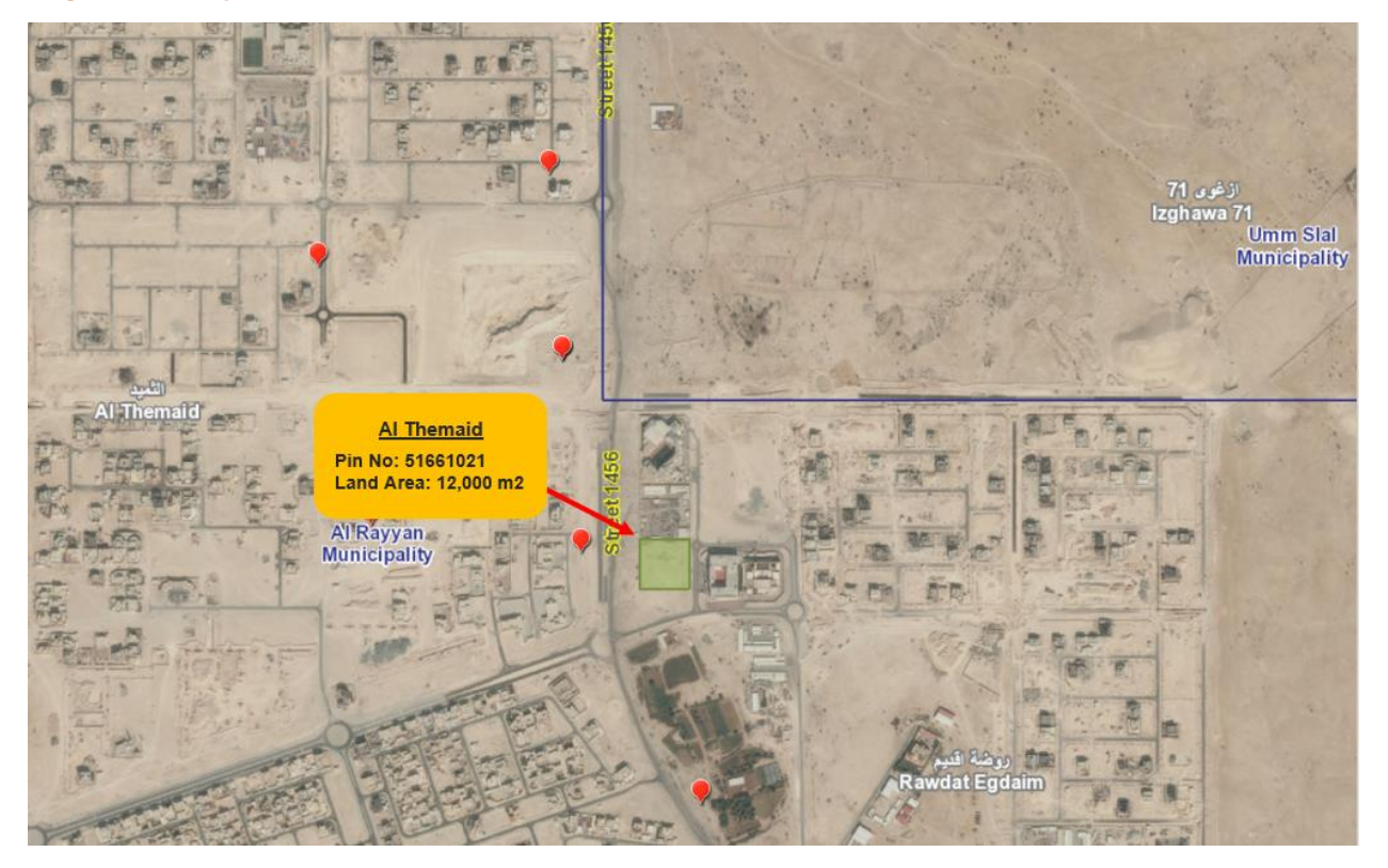
Figure 5. Project Site – Al Themaid

The site for the new Health Centre is located on the far outskirts of Doha, where the catchment population is growing and requires primary health care provision and capacity. The site location is indicated in the below figure with plot area and associated pin number.