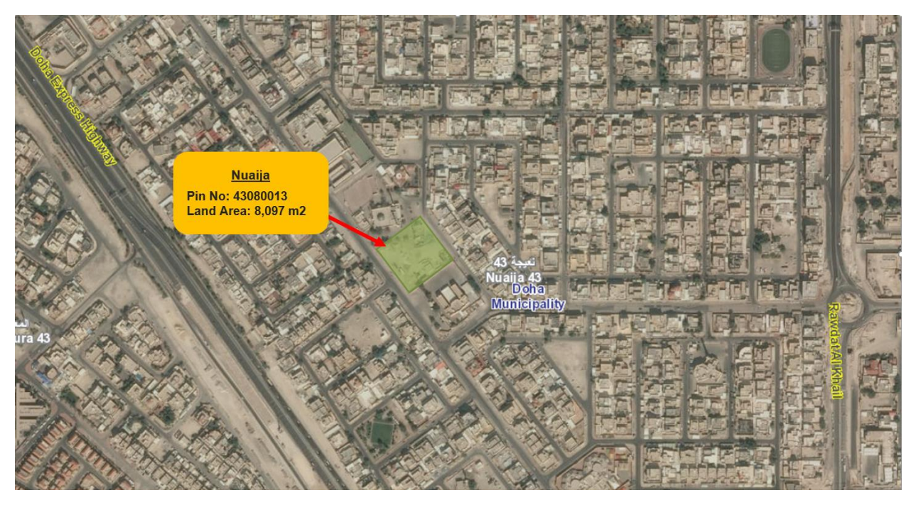
Figure 4. Project Site – Nuaija

The site location is indicated in the below figure with plot area and associated pin number.