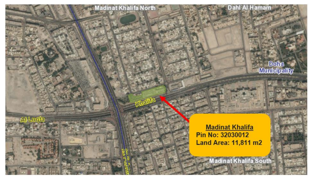
Figure 2. Project Site - Madinat Khalifa

The site location for the proposed Madinat Khalifa health centre is indicated in the below figure along with plot area and associated pin number.