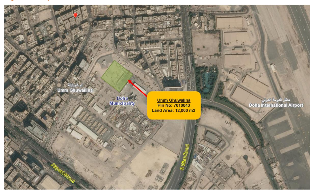
Figure 3. Project Site - Umm Ghuwalina

The Site location is indicated in the below figure with plot area and associated pin number.