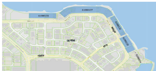
Figure 1: Project Sites with associated plot No

The Contracting Authority is looking for a suitable private sector developer / operator (the "Project Company") with international and/or regional experience to develop and operate five (5) beachfront plots in the West Bay Area along with Al Safliya Island (the "Project") which will feature a range of offerings including accommodation, Food & Beverage, and leisure activities: