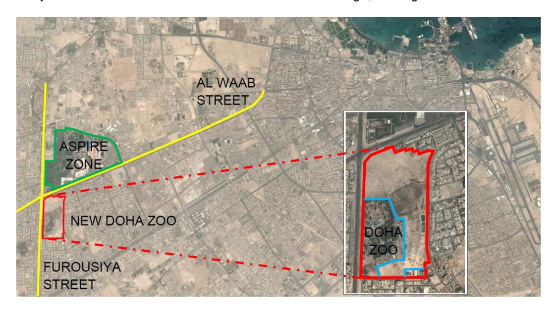
Figure 1.1 – New Doha Zoo Site

1.4.1 The New Doha Zoo is located approximately 12km from the city centre, adjacent to Aspire Park and the Villaggio Mall within the municipality of Al Rayyan. The existing Doha Zoo entrance is on Furousiya Street to the south of the Al Waab Street interchange, see Figure 1.1.