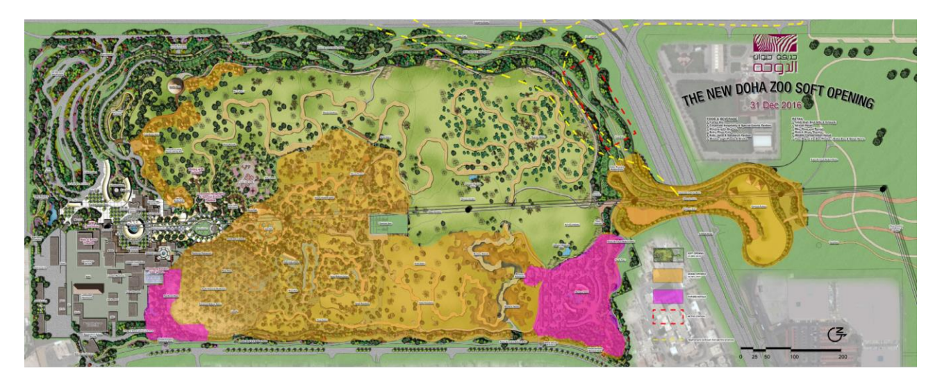
Figure 1.3 - The Phasing Plan

1.8.1 The tree and plant works (supply and install) contractor shall complete the landscaping scope of works in coordination with the main contractor to achieve the SOFT 31<sup>st</sup> December 2016 and GRAND 31<sup>st</sup> December 2017 openings, see Figure 1.3.