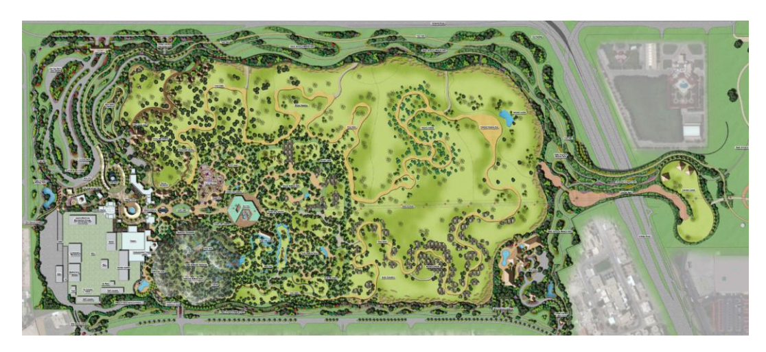
Figure 1.2 - Concept Design of the New Doha Zoo

1.4.4 The New Doha Zoo concept design includes twelve thousand five hundred (12,500) trees including approximately one thousand (1,000) retained from the existing zoo soft landscaping. The quantity of trees and plants shall be confirmed through the development of the various stages of the design, schematic, technical and detailed design.