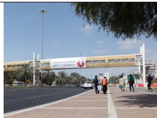
Type 2a Bridge Example