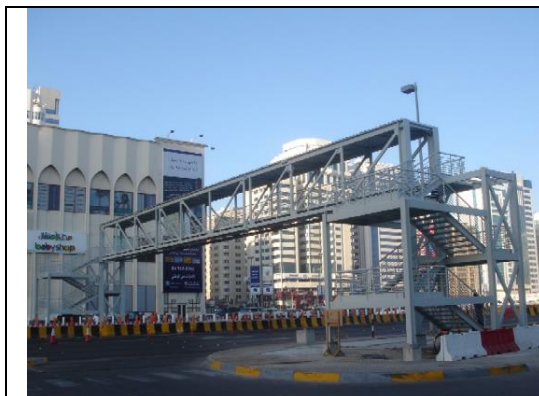
Type 1 Bridge Example